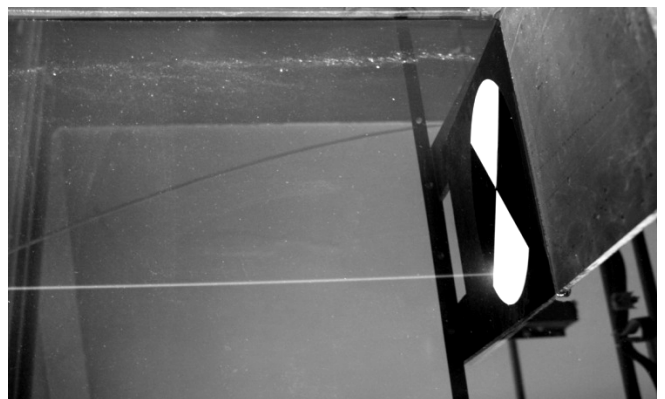
Figure 6. Hydraulic metering channel, green laser pulse hits Secchi disk, maximum measuring depth of 16 m

A hydraulic metering channel (figure 6) was used to gain more technical expertise on the maximum measuring depth, the way of propagation, and the characteristics of optical reflection of different materials compared to those in air. Measurements up to a maximum depth of 16 m were performed. The metering channel gave the possibility to investigate the effects on widening of the laser beam in water. Already a relevant enlargement is given in clear water and the effect grows with increasing turbidity. Turbidity is a factor which limits the system's spatial resolution, i.e. the minimum size of objects to be differentiated from their surrounding terrain (footprint size).