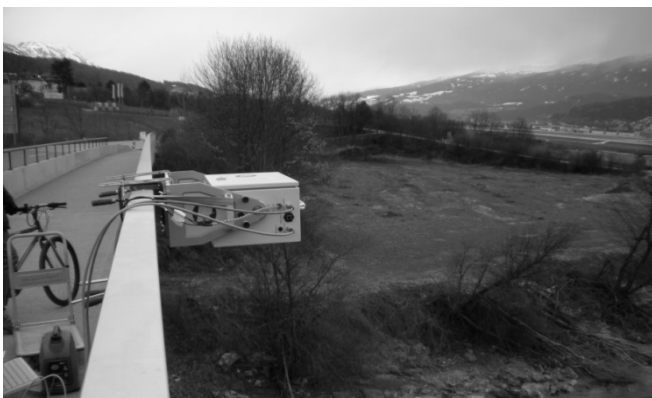
Figure 7. Experimental setup of breadboard system at river Inn

In addition, a modular cell concept was built to simulate a natural river. The 30 m x 2.5 m x 2.5 m basin is fitted with an artificial surface structure (made of Styrofoam cubes). The test field will be the basis for further research work during 2010 and the reference surface for calibration and validation of the system (figure 8).