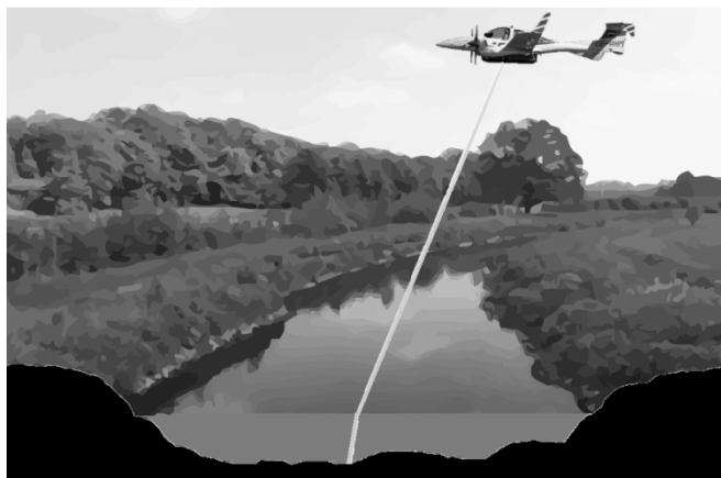
Figure 1. Airborne Hydromapping – shallow water bathymetry in a fast and economic way

The Unit of Hydraulic Engineering of the University of Innsbruck together with RIEGL Laser Measurement Systems investigate the potential performance of a world-wide first airborne laser scanning system, particularly designed for hydrographic surveying of shallow water areas. The concept of “Airborne Hydromapping” has the potential to meet the present and future requirements with respect to collecting up-to-date, high-quality, and high-resolution survey data in a fast and economic way (figure 1).