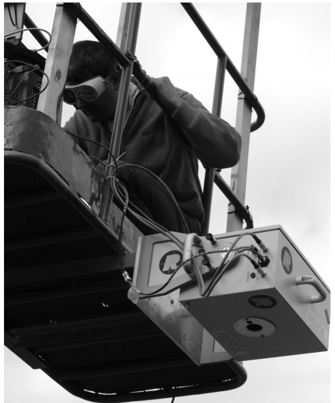
Figure 3. Lifting platform with attached breadboard system, laser and sensor orientated down to basin

Preliminary tests contained the gathering of information about the effects on pulses on their way through water. The key components of the measuring unit were a pulsed laser with an emission at 532 nm (green wavelength), a highly sensitive receiver for the reception of the echo signals, a trans-impedance amplifier and a digital oscilloscope for signal recording. Further processing and analysis took place on a PC. The equipment was mounted on a lifting platform up to 25 m above a water basin (figure 3, figure 4). Employing a water basin and a lifting platform made it possible to determine the characteristics of the laser and the opto-mechanical components. The water depth (up to 2 m), water properties (transmission), and the height of the laser platform (up to 25 m) were varied and the corresponding results were documented.