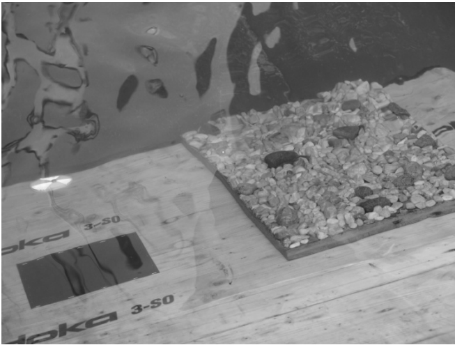
Figure 4. Different targets in water basin (assorted sizes of gravel, reflective materials), the basin offered a stepwise adaption of water depth and turbidity

The intent of the research project is to design and develop an airborne bathymetric laser scanning breadboard, optimized for shallow water areas, optimized to be able to segregate the recorded signal even at a minimum water depth, which at the moment is estimated to be around 20 cm. The possibility to use the same laser source to capture water surface and bottom was investigated. Water waves lead to a different strength of the surface echo signals and could eventually cause it to even disappear completely. Further on, waves lead to variable impact angles. The refraction of the laser light consequently leads to a variation of propagation directions of the laser beam under water. In the experiments, this caused the laser footprint to roam around the bottom surface. This effect can be mitigated by using laser beams broad compared to the surface wave dimensions, and measuring only at comparatively still water conditions.