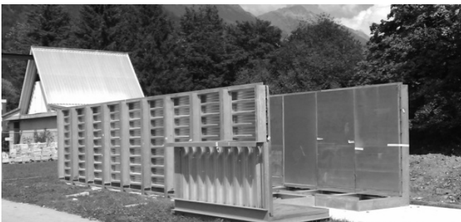
Figure 8. Modular cell concept, formed Styrofoam cubes build a natural river surface structure