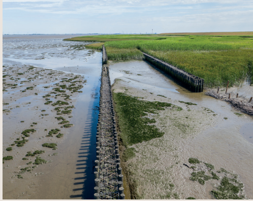
Double pile rows with stone filling and openings in offset arrangement (BAW)